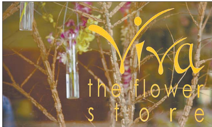
INVITING: The window of Viva the flower store in Angaston.